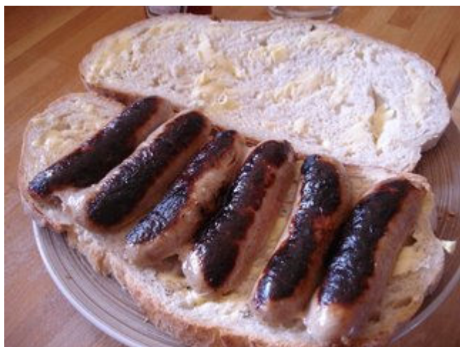
A Sausage Butty

Let us know and we can include it in the next issue.... inform@integral.co.uk